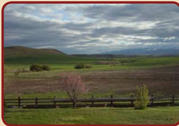
The 4,000 acre Granger Butte Ranch.