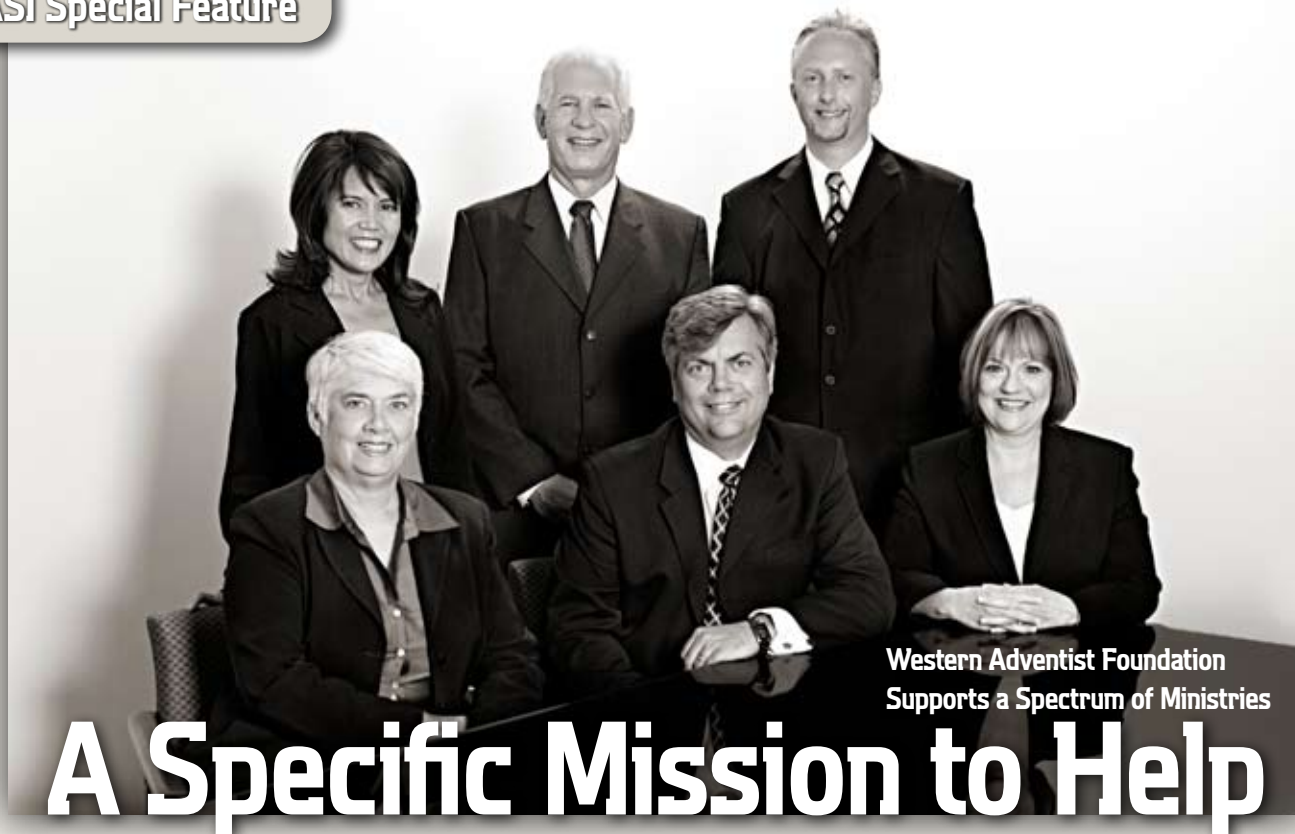
Western Adventist Foundation Supports a Spectrum of Ministries