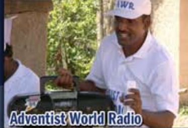
Adventist World Radio

ASI ADVENTIST-LAYMEN'S SERVICES & INDUSTRIES