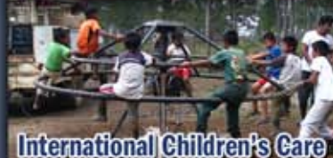
International Children's Care