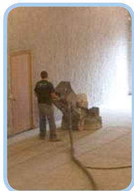
Before set construction could begin, the floor had to be specially prepared to make it perfectly smooth for the camera wheels.

down, the wear and tear and occasional lost set prop became a frustrating problem. The need for a new studio exclusively for children's programming was obvious. And as He has always done, the Lord opened the way.