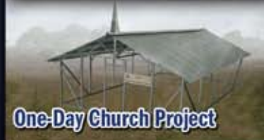
One-Day Church Project