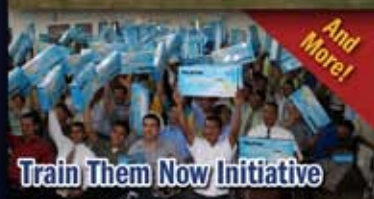
Train Them Now Initiative