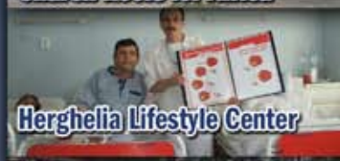
Herghelia Lifestyle Center