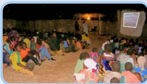
Evangelistic meetings were a core part of the Mission Extreme program.

Please give of yourself; reach out to a world in need.