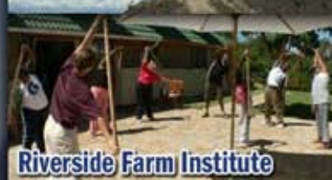
Riverside Farm Institute