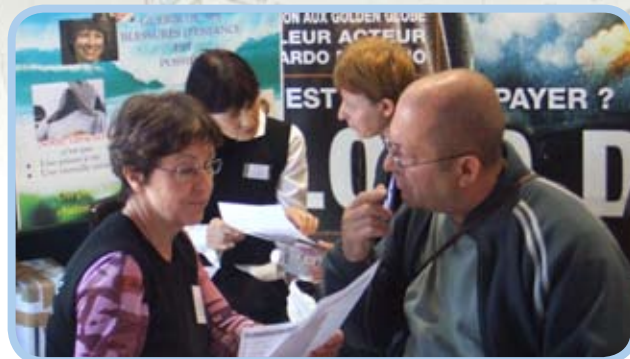
The Country Life Marseille Health Expo in France drew 700 visitors.