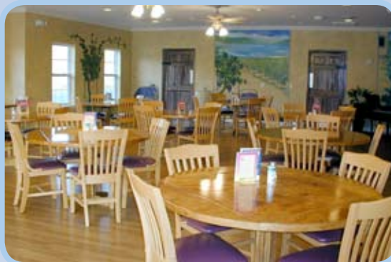
"The Vine" vegan restaurant offers healthy food in an attractive atmosphere.