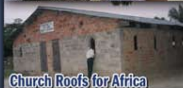
Church Roofs for Africa